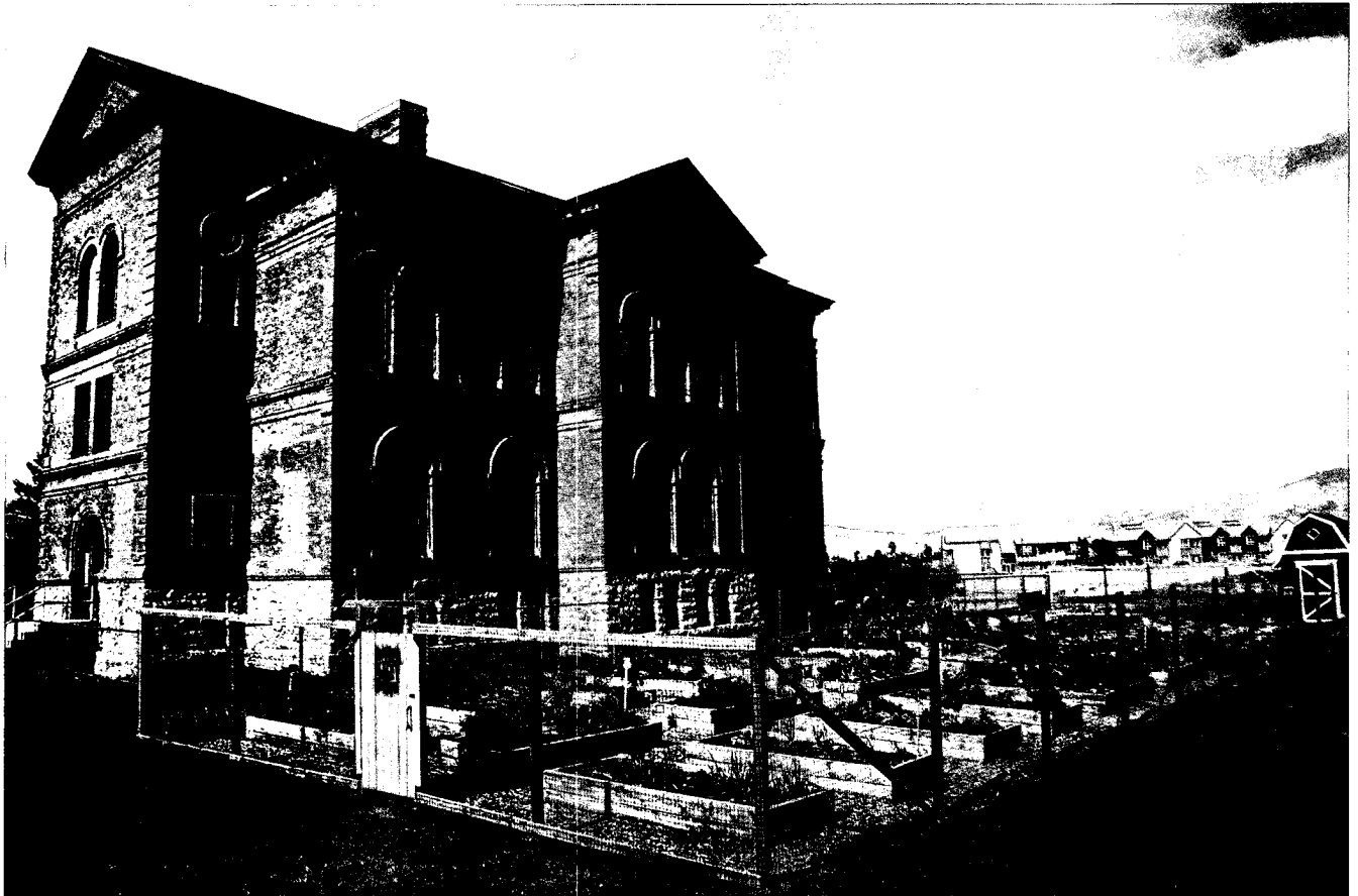
The Montana Deaf & Dumb Asylum (Main Hall) Wikimedia Commons; September 28, 2013, Rob Stutz