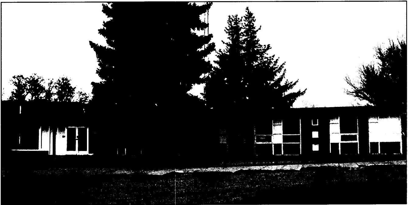
View of the Montana State Hospital -- Receiving Hospital (Post WWII) http://www.montanahistoricalsociety.bmp

The MT State Hospital Receiving Hospital (Post WWII) is located at Warm Springs, MT and is 63,033 square feet. In October 1954, the Montana Board of Examiners approved plans for a new receiving hospital and treatment building, prior to the passage of a bond, which required approval by Montana voters. Once that was approved, bids were received in 1956 and construction began in 1957. The dedication for the facility was held in August 1959. Forty years later the hospital was slated to be renovated, but the project was called off in December 2009 by the governor as a cost-savings measure. The halting of the renovation would save $4,500,000. The building now stands vacant and has been allowed to deteriorate. 1