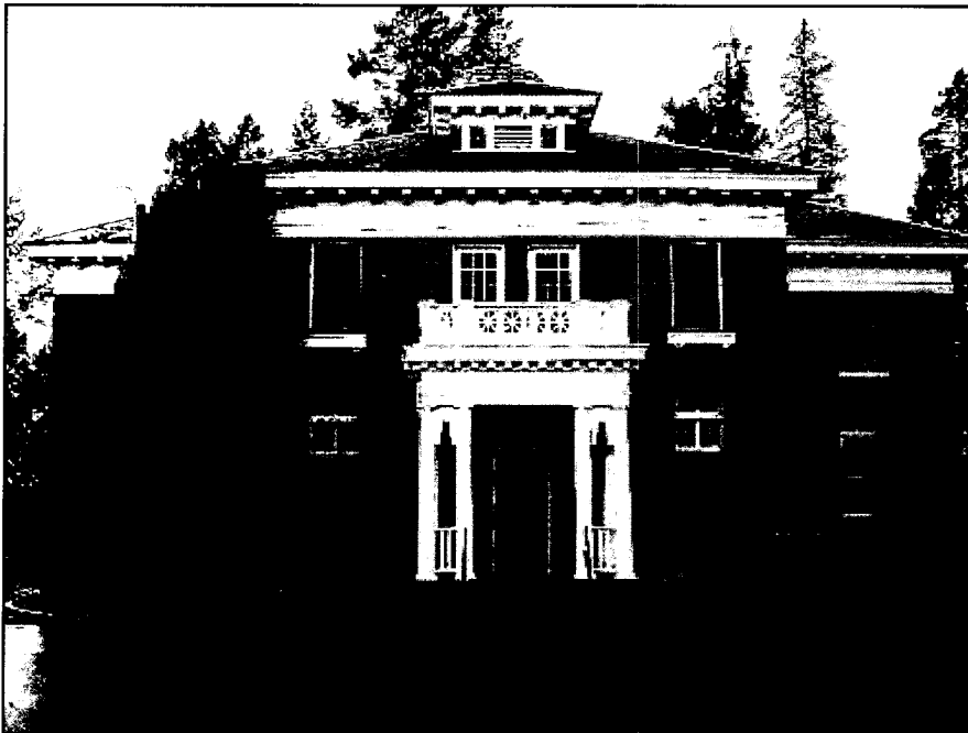
Montana State Soldiers' Home Service/Chapel Building http://www.dphhs.mt.gov/sltc/services/vethome/PhotosVets/CF08ServiceBldg.jpg