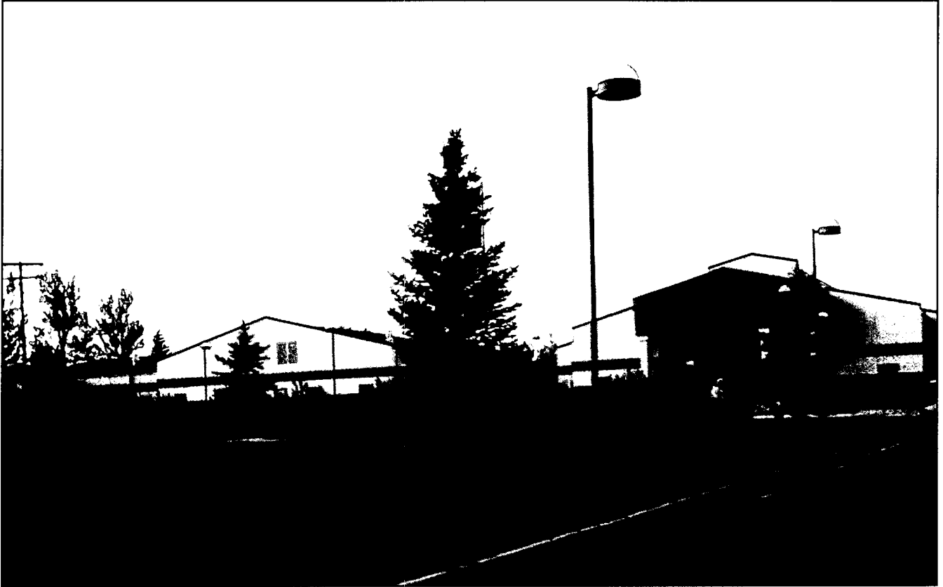
Montana State Hospital, modern facilities Wikimedia Commons, October 17, 2012, Montanabw; Warm_Springs_State_Hospital_02.jpg