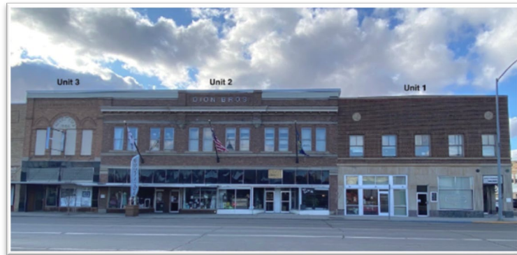
Dion Block, Glendive