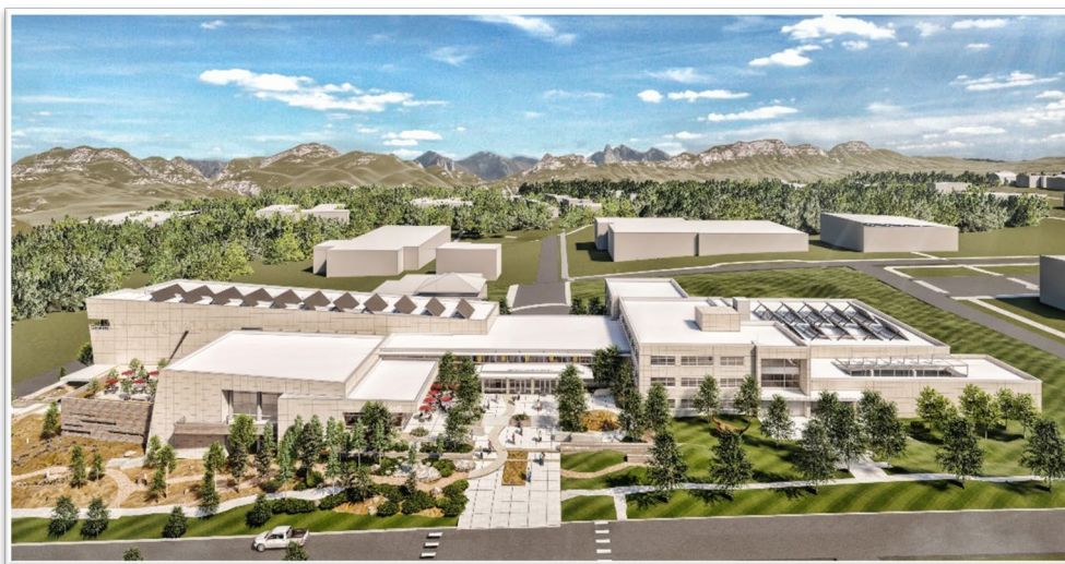
Montana Heritage Center